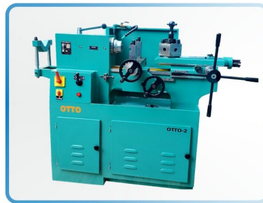
OTTO - 2