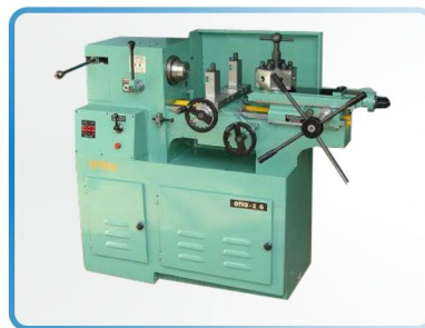
OTTO - 2G