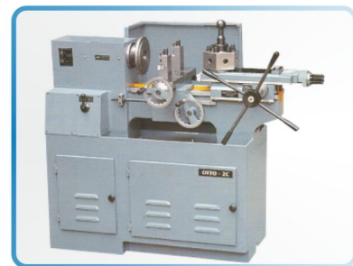
OTTO - 2C