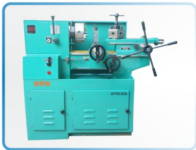
OTTO - 2CG